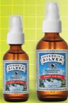
1 fl. oz. / 30 ml First Aid Gel 2 fl. oz. / 60 ml First Aid Gel

Keep one bottle in your bathroom cabinet, one in your car, and one in your purse or briefcase, so you'll always be prepared for life's little accidents.