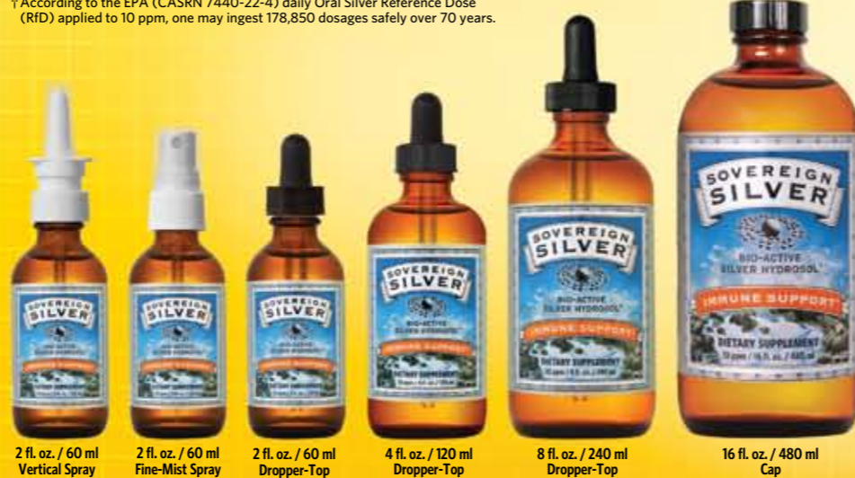
2 fl. oz. / 60 ml Vertical Spray

† According to the EPA (CASRN 7440-22-4) daily Oral Silver Reference Dose (RfD) applied to 10 ppm, one may ingest 178,850 dosages safely over 70 years.